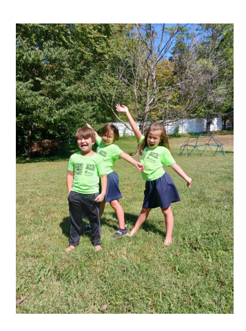
St. Joseph - Imperial