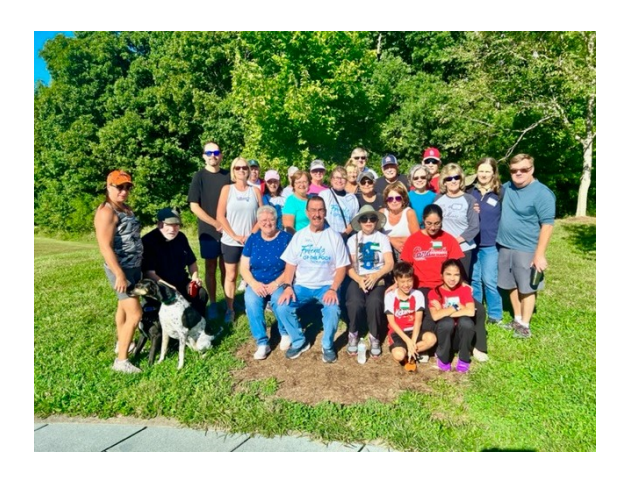
Immaculate Heart of Mary (Northwest)

Immacolata Queen of All Saints St. Paul, Fenton St. Bridget, Pacific St. Joseph, Imperial