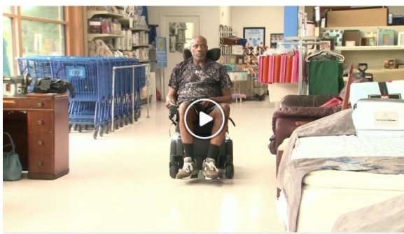
A Golden Gloves boxer is in a fight for his life against ALS. And a St. Louis County thrift store manager stepped in to help.